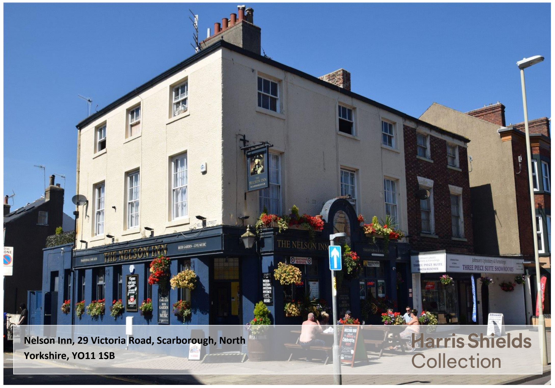
Nelson Inn, 29 Victoria Road, Scarborough, North Yorkshire, YO11 1SB